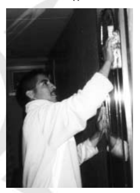
Program participant doing morning chores.

in the program who have committed an infraction that would have gotten them immediately expelled from other similar programs.